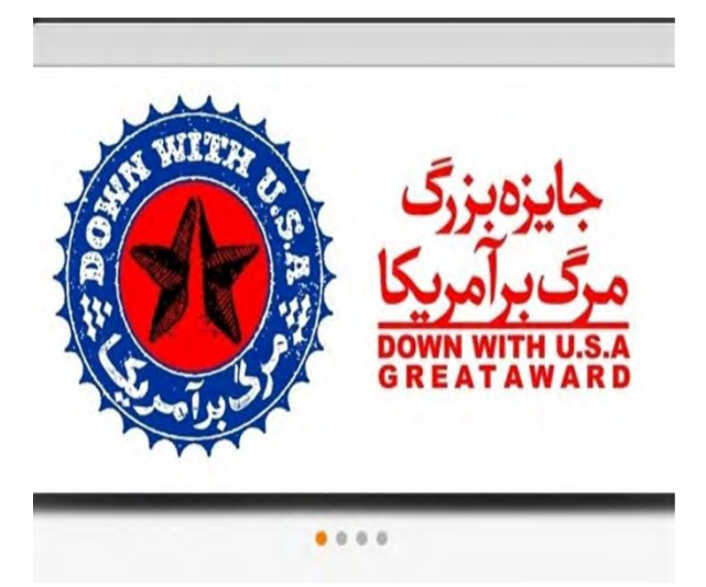
A poster from the "Death to America" competition, organized by Owj (Tasnim, October 23, 2013)

▶ The hostility toward the United States, a central pillar in the worldview of the Iranian regime, is clearly reflected in other activities of the organization. In 2013, Owj was one of the financiers of the competition "Death to America" held in Tehran. The competition included presentations of photos, posters, caricatures, documentary movies, music videos, blog posts and articles on various subjects all evincing hostility toward the United States (Tasnim, October 23, 2013).