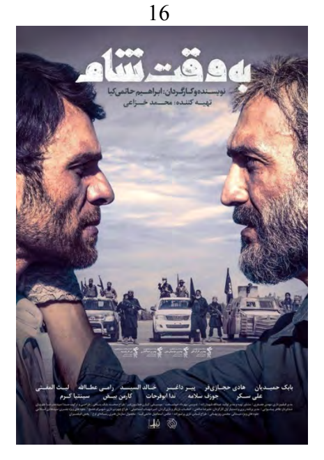
"Damascus Time" (Tasnim, April 11, 2018)

• The fifth season of the television series "Capital City 5" was aired on Iranian television during the break on the occasion of the Iranian New Year (Nowrooz) in the spring of 2018. The season depicted the story of a family from northern Iran, which happens to encounter ISIS terrorists after a crash of a hot-air balloon in Syria.