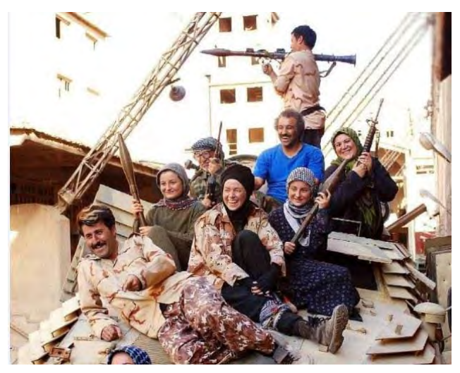
The TV show "Capital City 5" (ISNA, April 10, 2018)

• The fifth season of the television series "Capital City 5" was aired on Iranian television during the break on the occasion of the Iranian New Year (Nowrooz) in the spring of 2018. The season depicted the story of a family from northern Iran, which happens to encounter ISIS terrorists after a crash of a hot-air balloon in Syria.