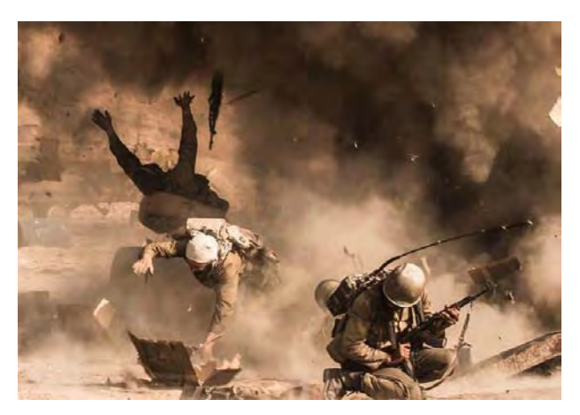
The movie "The Abu Ghraib Strait" (Tasnim, February 12, 2018)

▶ Many of the documentaries and series produced under the patronage of the organization deal with various historical events from the point of view of the Islamic Republic, and in particular, the Islamic Revolution and the Iran-Iraq War. For example, a series produced in 2017 depicts developments in the city of Khoramshahr in southwestern Iran from the outbreak of the Iran-Iraq War in September 1980, followed by its occupation by Iraq in October 1980, and until its liberation by Iran in May 1982. Another movie, by the name "The Abu Ghraib Strait" (in English, the movie was distributed under the name "The Lost Strait"), produced in 2018 and based on a true story, depicts the tale of an Iranian brigade that fought to defend a strategic strait against a ferocious Iraqi assault during the Iran-Iraq War.