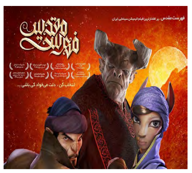
The poster of the movie "The Holy Cast"

perpetrated by the "forefathers of the criminal sons of Zion against the Christians" (Owj website, February 3, 2016).