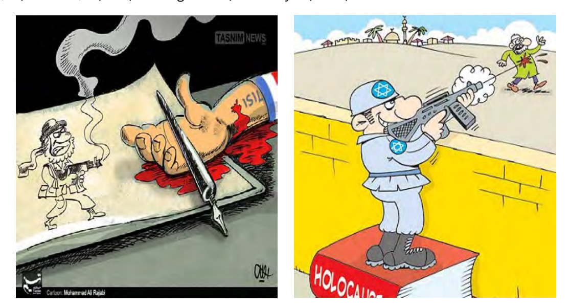
Caricatures presented in the second competition of caricatures about the Holocaust (2015), which Owj Organization took part in financing. (Tasnim, January 19, 2015; Difaa Fars, January 19, 2015)

▶ As part of the organization's anti-Israel and anti-Zionist activity, the organization was involved in Holocaust denial events routinely held in Iran. In 2015, Owj was one of the financiers of the second competition of caricatures about the Holocaust, which was held by the "House of Caricature" and the organization "Sarcheshmeh", which operates under the auspices of the Islamic Propagation Organization. On the eve of the competition, Owj announced an increase in the value of the prizes for the first three places to $10,000, $16,000 and $24,000 (Mashregh News, February 25, 2015).