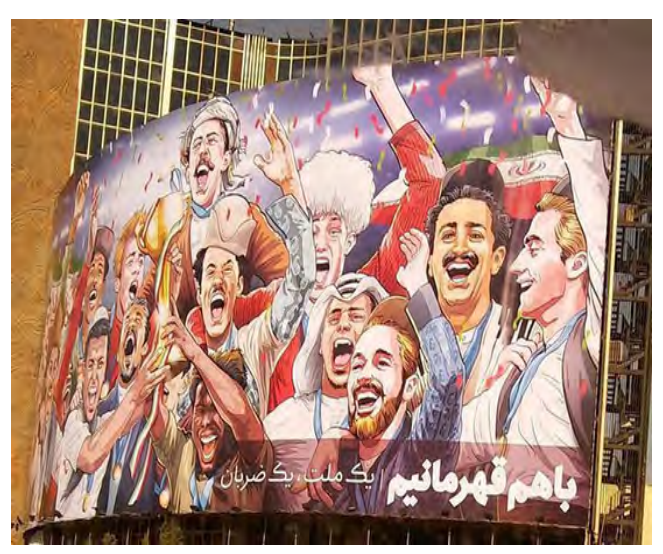
"All of us are champions together" (Twitter, June 15, 2018)

▶ This was not the last time that a propaganda effort of the organization caused controversy. Recently, a firestorm erupted against the organizations following a billboard mounted in Tehran ahead of the 2018 FIFA World Cup in Russia. The poster, hung to salute the Iranian national team, said: " all of us are champions together: one nation, one heartbeat ." The poster included several characters representing the various and diverse ethnic groups that make up Iranian society, but it did not include even one female character. Following widespread public outcry due to the exclusion of women, the sign was removed and replaced with another.