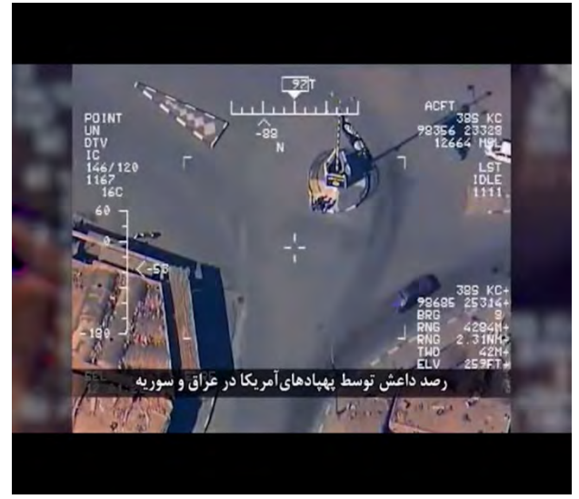
Screenshot from the documentary "Warlords" (https://www.youtube.com/watch?v=4AdgkvvCGbY)

▶ In May 2018, the organization distributed a documentary video titled "Warlords," which relied in part on footage of U.S. aerial photography drones. The 25-minute video intended to prove that the United States is providing military, logistic and intelligence support for ISIS (yjc.ir, May 10, 2018).