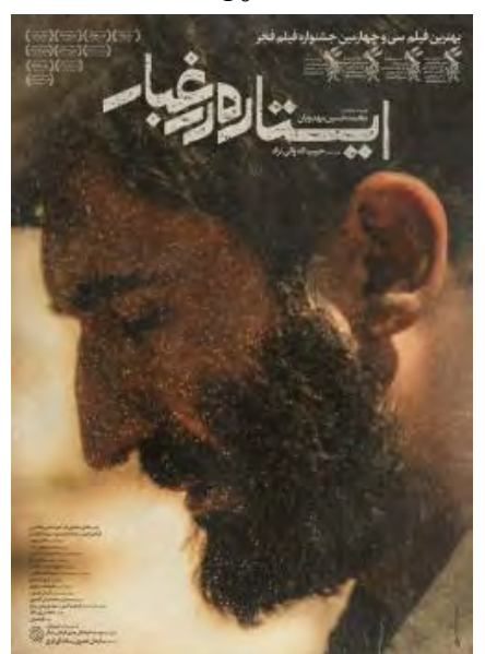
The poster of the movie "Standing in the Dust" (the website of Owj Organization, July 2, 2017)

▶ The serials and movies produced by the organization also serve to promote Islamic religious values. One such example is a television series that takes place in Yazd and portrays life around the mosque in the city. Even movies that appear not to be guided by ideology, are marshalled to spread the worldview of the revolutionary current in Iran. Thus, for example, Owj produced a documentary about the football star Diego Armando Maradona, which shows how the Argentinian player was able to "humiliate the imperialist countries." Another documentary focused on the life and activities of Lawrence of Arabia, a British archeologist and officer, who operated across the Arab world in the early 20<sup>th</sup> century and during World War I. By drawing attention to the figure of Lawrence of Arabia, the movie seeks to emphasize the negative ramifications of Western imperialism in the Middle East.